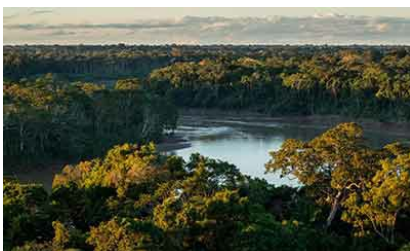
Global Debt-for-Nature Swaps